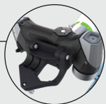
Quick release design: Switch from automated to handheld mode