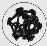
Also available for the MetraSCAN 3D